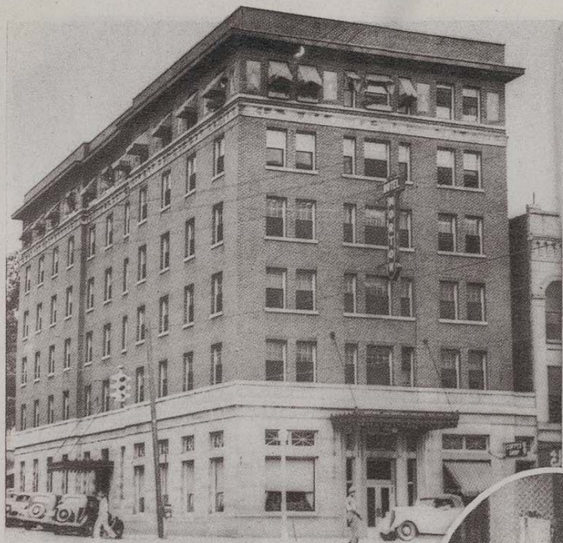
Hotel Norton, Norton, Virginia, 100 Rooms of Comfort.