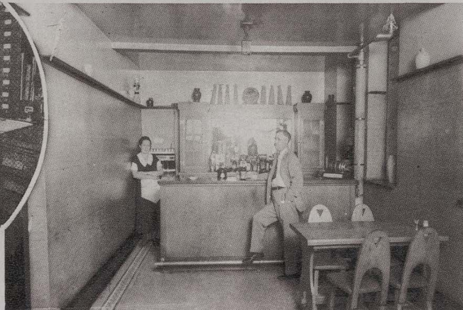
"Where Good Fellows Meet"—The Old English Tap Room.